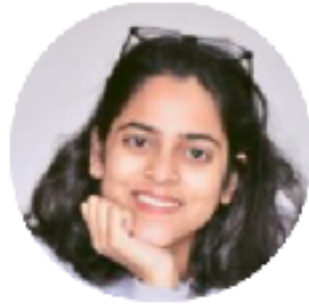
Aryavani GNDU Ph.D. Entrance 2021