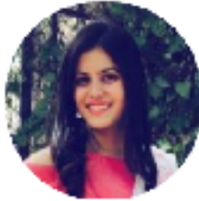
Khayati - Christ, Bangalore