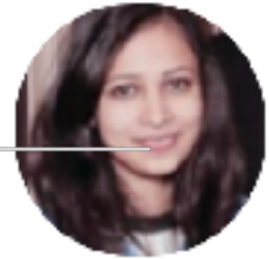
AARTI - Christ, NCR