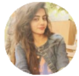
Aman - NET

For more information visit our website: https://psychopedia.in/